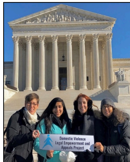
Staff Members of DVLeap in front of the US Supreme Court

The case briefs are recognized by national experts as effective training tools for attorneys representing and protecting battered mothers.