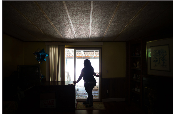
A.B. client pictured at home